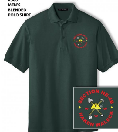
Section NE-4B Blended Polo

To Purchase any of the items showcased here, visit NE-4B's official trading post at: http://www.sgtradingpost.com/sub_cat.php?sub_category_id=279