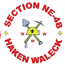
CP94 KNIT CAP