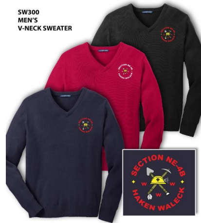
Section NE-4B V-Neck Sweater