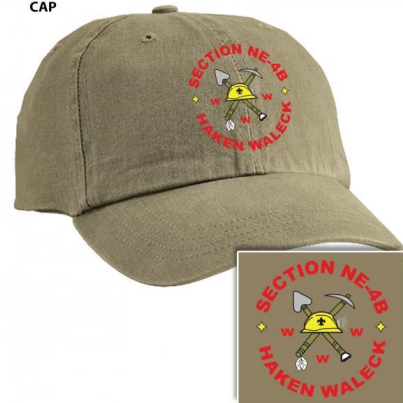
Section NE-4B Garment Washed Cap