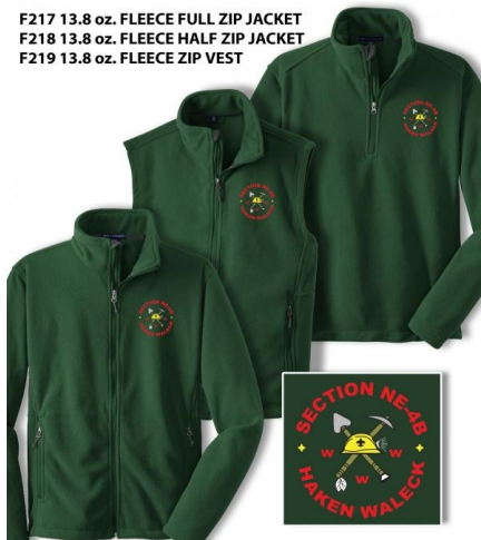
Section NE-4B Fleece Jacket